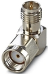
Antenna adapter, frequency range: 0.3 GHz ... 6 GHz, connection: RSMA (male) -> RSMA (female), 90° angled

Please be informed that the data shown in this PDF Document is generated from our Online Catalog. Please find the complete data in the user's documentation. Our General Terms of Use for Downloads are valid ( http://phoenixcontact.com/download )